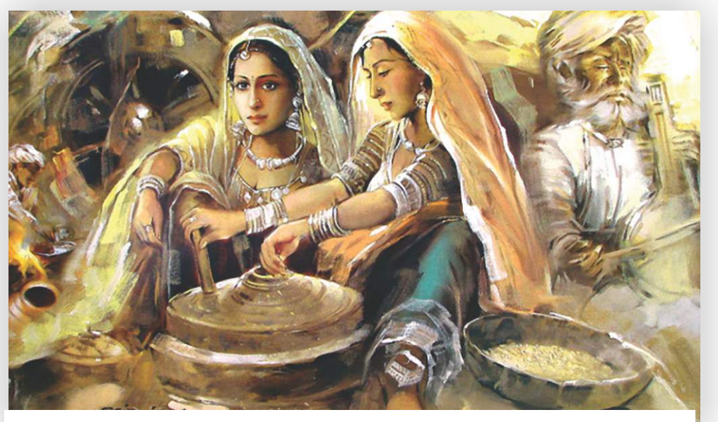
Rajasthan.... The Incredible State of India

t is beautiful how sometimes, written, unwritten, said, unsaid words, all seamlessly turn avoidable for a while, detaching themselves from being perceivable or comprehensible and yet some missing hint is left behind for you to form an unknowing connection with your deeper self. Connection that surpasses all reason and logics you had known earlier and yet make you feel alive. It's the connection to happiness, sheer happiness. Sitting alone on a couch at home, you are taken to the world of unknown pleasure, where the frosty breeze near the seashore in twilight impeccably passes across your ears, remarked by little coldness Ironically, happiness is not a question and a buoyant spirit. You feel like opening up your arms and your itself, but rather a "buried" answer to soul to the entire world to enclose all of the goodness within you every question we have been seeking an